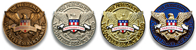
Award lapel pins Bronze, Silver, Gold, Call to Service Award

*Each member contributing at least 25 hours towards the total