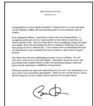
Congratulatory letter from President Obama

Note: Individuals who have completed 4,000 or more volunteer service hours over the course of their lifetime are eligible to receive the President's Call to Service Award.