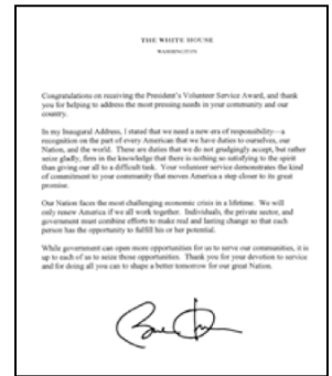
Congratulatory letter from President Obama

Note: Individuals who have completed 4,000 or more volunteer service hours over the course of their lifetime are eligible to receive the President’s Call to Service Award.