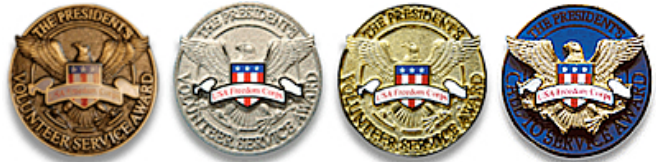
Award lapel pins Bronze, Silver, Gold, Call to Service Award

*Each member contributing at least 25 hours towards the total